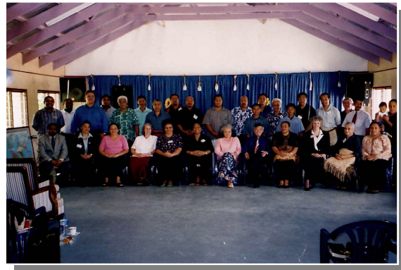
JOSHUA GENERATION LEADERS SUMMIT, KINGDOM OF TONGA