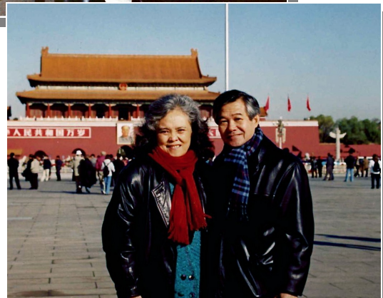
20TH ANNIVERSARY CELEBRATION OF ESEC, GREAT HALL OF THE PEOPLE (BEIJING)