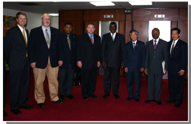
THE JOSHUA GENERATION TEAM AND PRIME MINISTER EPHRAIM INONI

The Lord granted the team favor wherever they traveled. At the conclusion of every meeting with a government minister, secretary general or attaché, they were allowed to pray and speak blessings over each respective ministry department, as well its leaders and personnel. After the ten-day trip, The Joshua Generation is prayerful and excited to see what God has in store for Cameroon in the near future.